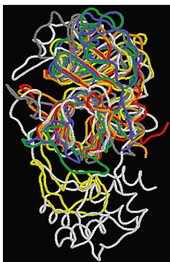
Figure 3. The superposition of SARS-CoV main proteinase (1Q2W, white) with other proteases: 1L1N (Poliovirus 3c Proteinase, red), 1CQQ (Rhinovirus 3c Protease, orange), 1MBM (Nsp4 Proteinase From Equine Arteritis Virus, yellow), 1DY8 (Hepatitis C Virus Ns3 Protease, blue), 1QA7 (Hepatitis A Virus 3c Protease, gray), and 1DF9 (Dengue Virus Ns3-Protease, green).

conducted the docking studies of KZ7088 (a derivative of AG7088) to the SARS-CoV main proteinase (based on a theoretical model). Here, we studied the possibility of other inhibitors in anti-SARS drug development. Figure 4 shows the structures of docking other inhibitors from HAV, HCV and Dengue virus to SARS-CoV main proteinase, the residues that make contact with these inhibitors are marked as '#' in Figure 2. Furthermore, the corresponding binding pockets are shown in Table 1. The results reveal that these inhibitors can bind to SARS-CoV main proteinase well.