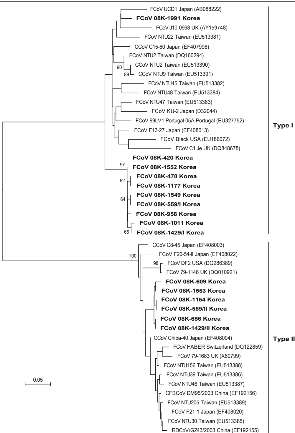
Figure 2 Phylogenetic relationships between partial spike gene sequences of 46 coronaviruses. The samples were comprised of 16 FCoVs from Korea, 23 FCoVs from around the world, five CCoVs, one RDCoV, and one CFBCoV. All sequences except the 16 FCoV sequences derived from the current study (in boldface) were obtained from GenBank. An unrooted phylogenetic tree was constructed from aligned sequences by the neighbor-joining (NJ) method using MEGA 4.0 software. Bootstrap percentages are shown above those branches that are supported in at least 60% of the 1,000 replicates. Scale bar indicates nucleotide substitutions per site.