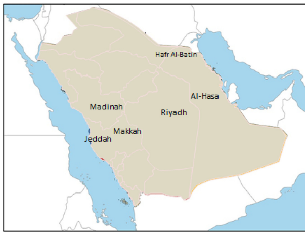
Figure 1 A map of the Kingdom of Saudi Arabia showing the main cities described in this paper: Riyadh (the capital); Al-Hasa (2013 outbreak); Jeddah (2014 outbreak); Hafr Al-Batin (community cluster); and the holy Cities (Makkah and Madinah).