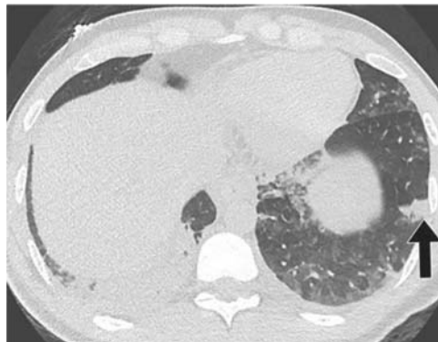
Fig. 11 Lung CT MERS CoV [31]. 27-year-old man with Middle East respiratory syndrome Patient was a smoker who was healthy otherwise. CT was performed 8 days after admission, and 20 days after onset of symptoms. Patient was eventually discharged. Lower lung CT image show large right lower lobe and small focal left lower lobe subpleural consolidations.

Chest XRays and CT Scanning (Figure 11) are recommended depending upon the presentation, and clinical course. In the Aljan study [31] the most common CT finding in hospitalized patients with MERS – CoV infection reveals predominantly