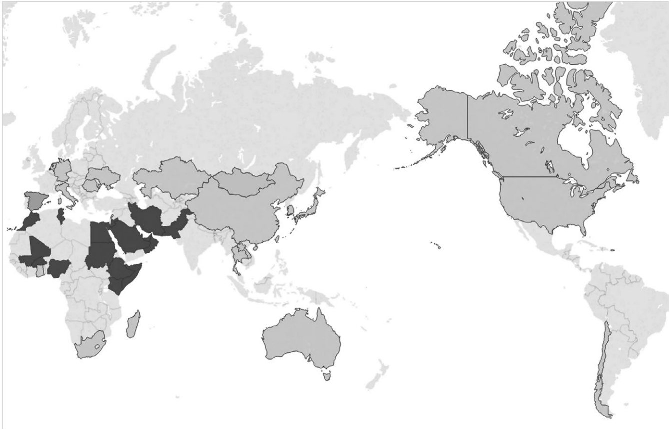
FIGURE 2 Countries with reported MERS-CoV exposure or infection in animals, based on publications included in this scoping review. Countries with light shading indicate where samples were collected, but none tested positive to MERS-CoV. Countries with dark shading indicate where samples collected from animals in at least one study tested positive to MERS-CoV either by antigenic or antibody testing

All experimental studies that involved livestock included in their methodology the testing of animals prior to challenge or vaccination. Two studies that used purpose-bred white mice did not report testing the animals for MERS-CoV prior to intervention. The duration of experimental studies ranged from 24 to 84 days after the first intervention (pathogen or vaccine inoculation), and six out of nine studies reported sampling subjects for greater than one month. One study used positive controls, while four studies used negative control subjects (none reported both types of controls).