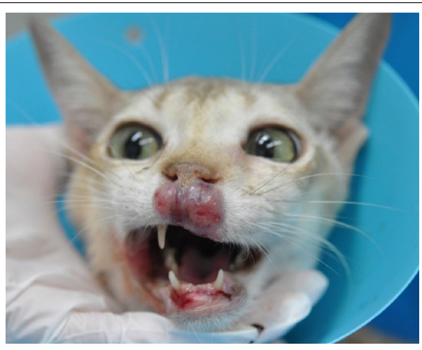
Figure 1 Clinical appearance of the skin lesion on the upper lip at initial presentation

The referring veterinarian had prescribed subcutaneous feline interferon-omega (Intercat; Toray) at a dose of 2 MU/cat for 8 weeks administered at 1 week intervals, and oral norfloxacin (product details unknown) at a dose of 12 mg/cat q12h for 2 months to treat the cutaneous nodule, upper respiratory signs and stomatitis. Although the general condition of the cat