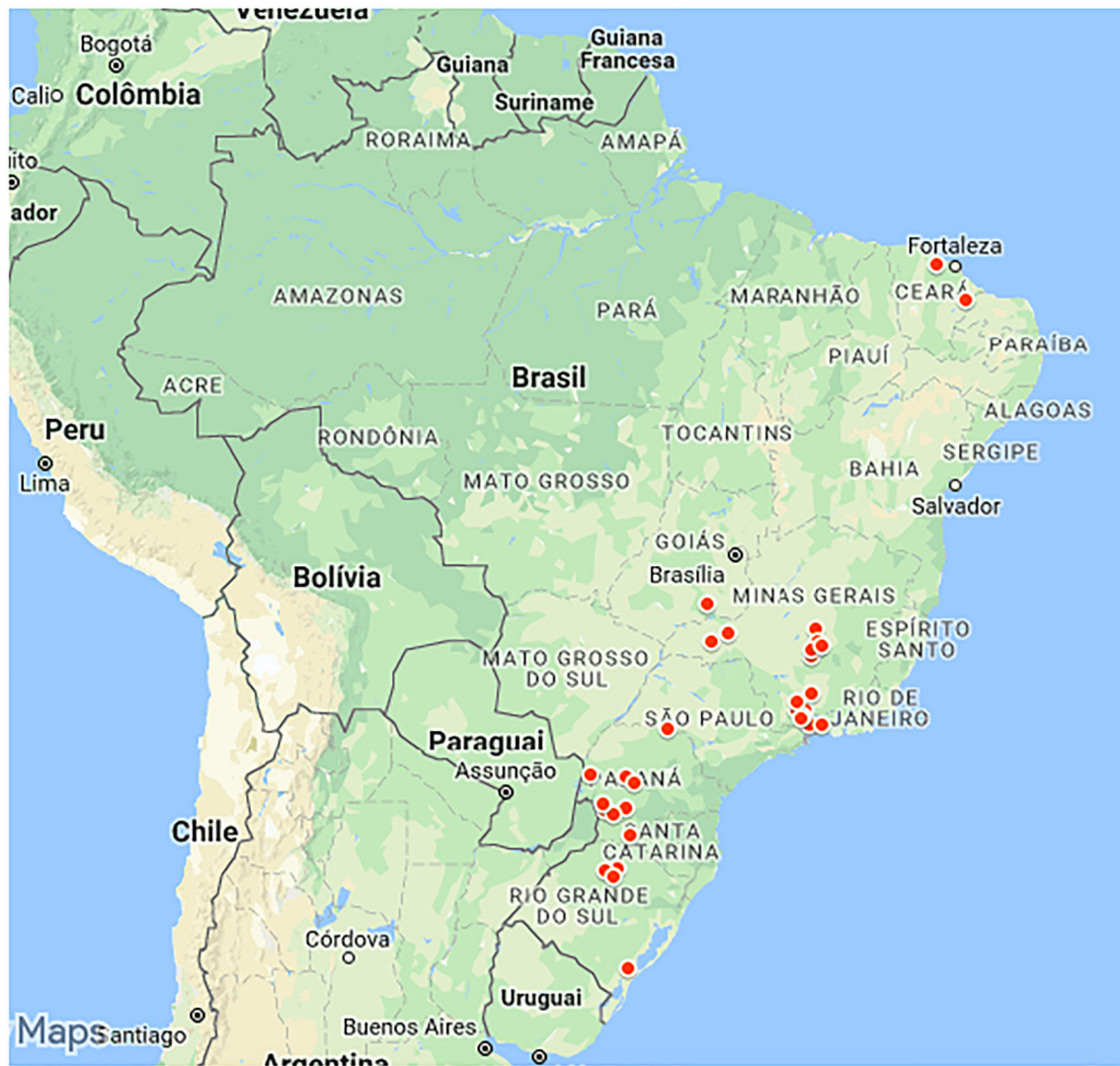
Fig. 1 Spatial distribution of the 39 farms belonging to 29 municipalities located in eight states of Brazil analyzed in this study

guanidinium isothiocyanate nucleic acid extraction methods (Alfieri et al. 2006). Samples were screened for RVA by silver staining after polyacrylamide gel electrophoresis (PAGE) (Herring et al. 1982) modified by Pereira et al. (1983).